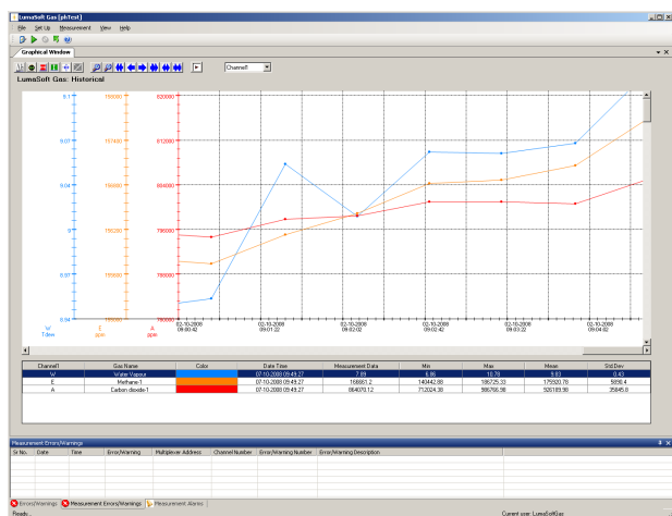
Fig. 1: The graphical window shows up to seven graphs. The user selects the data plotted, the scaling, and the style and color of the lines and background to build the graphical window.

In the 7820/7880 software, the graphs can be configured to display only the desired gases, defined concentration ranges, and results from statistical analyses. Also, when using the 7880 software, all measurement data is stored in user-defined SQL Server 2014 database.